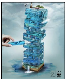
(Google WWF Jenga ad)

In maths we have started our unit on addition and subtraction. The focus is on developing mental computation skills using strategies such as the jump, split and compensation strategies. The students have been surprised when I announce "I don't care about the answer!" Students often get so caught up with getting the answer correct they revert to inefficient strategies, such as counting on by ones. I encourage them to choose an efficient strategy and show me their working out. It's always great to see students working through this process.